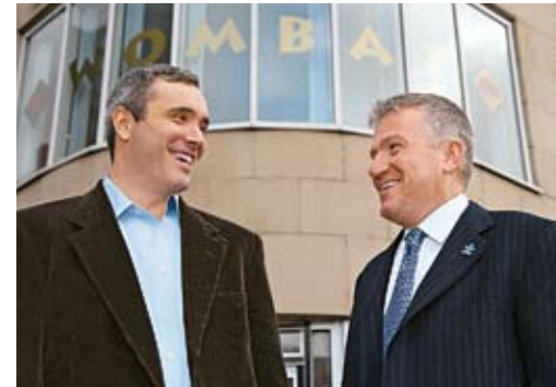
NYSE EURONEXT CEO DUNCAN NIEDERAUER (RIGHT) IS PICTURED WITH DANNY MOORE, CO-HEAD OF NYSE EURONEXT'S NEW ADVANCED TRADING SOLUTIONS DIVISION AND FORMER CEO OF WOMBAT, OUTSIDE WOMBAT'S ENGINEERING CENTER OF EXCELLENCE IN BELFAST, IRELAND.

those expressed or implied in such forward-looking statements. Factors that could cause NYSE Euronext's results to differ materially from current expectations include, but are not limited to, NYSE Euronext's ability to implement its strategic initiatives, economic, political and market conditions and fluctuations; government and industry regulation; interest-rate risk and U.S. and global competition; and other factors detailed in NYSE Euronext's reference document for 2007 ("document de référence") filed with the French Autorité des Marchés Financiers (Registered on May 15, 2008 under No. R. 08-054), 2007