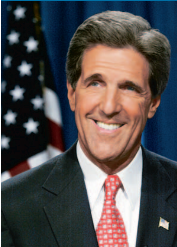
"THE ECONOMY NEEDS SHORT-RUN STIMULUS WITHOUT INCREASING THE LONG-RUN DEFICIT."

“With sound economic policies and smart investments in the future, the American economy can do much better than it has done in the last four years.”